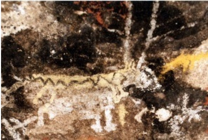
Photo 1. Coso Painted Style pictograph of historic longhorn cattle.