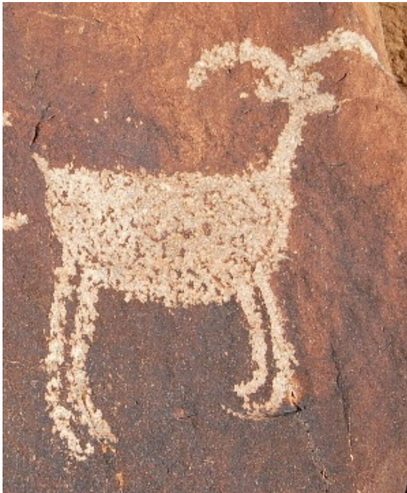
Photo 2. Coso Representational Style petroglyph bighorn.