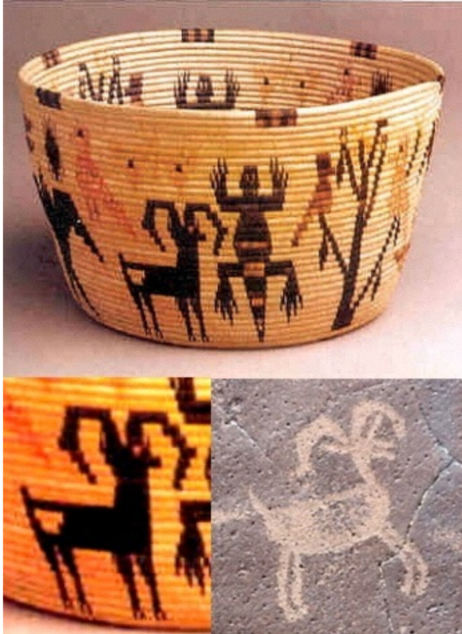
Figure 7. Panamint Figurative Basket. Basket designs contain images of chuckwalla, birds, and bighorn sheep. Enlarged image of sheep is compared with bighorn sheep petroglyph image found in the Coso Range (lower right) Image after Slater 2000.