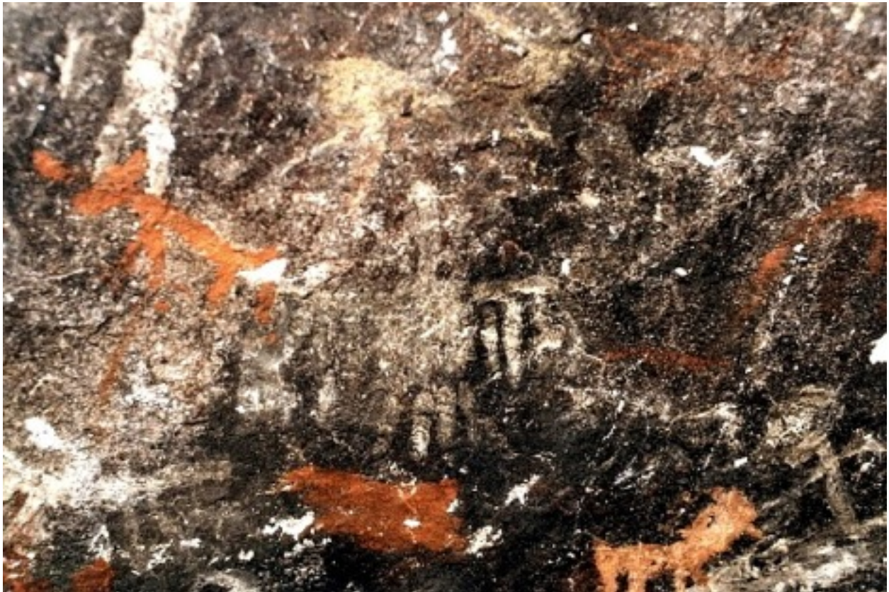
Photo 7. Polychrome section of an eastern California pictograph panel.

cultural destruction of their traditional lifeways reached its zenith. If there is a correlation between these two phenomena then rock art sites containing historic elements and painted sheep might then date from no earlier than 1850 to perhaps no later than the turn of the century. We base this determination on the following.