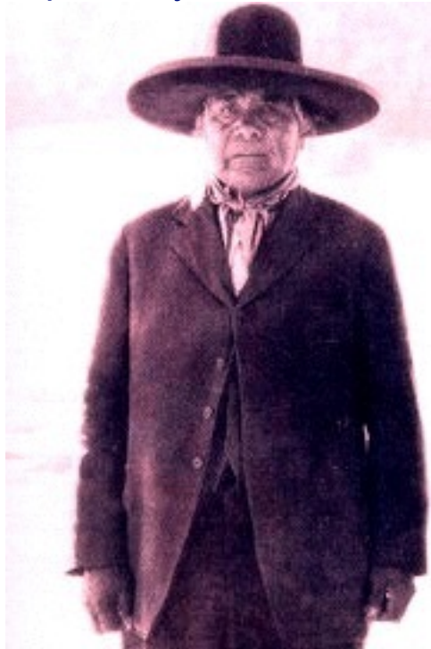
Photo 4. Wovoka in later years.