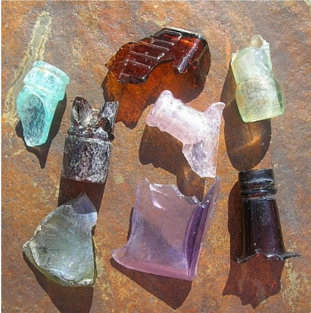
Photo 8. The chemical composition of glass, shape of the vessel and bottle neck characteristics help determine a range of time during which the glass was manufactured. Glass fragments shown are typical of the late 1880's to early 1900's.

The two westernmost expressions of the Coso Painted Style (Garfinkel 1978; Garfinkel et al. 1980: 335-338) are found on the crest of the Sierra Nevada. These two pictograph panels contain a total of 14 individual elements. Thirteen of these elements are painted in a striking variety of colors including red, white, black, pink, and orange. One painting is located on a large granite boulder overlooking an ephemeral drainage between two prehistoric campsites. Depicted on that panel are two bighorn