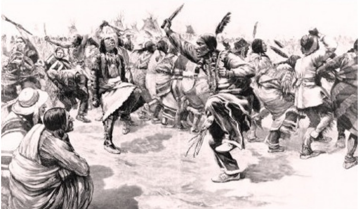
Photo 11. This 1891 Smithsonian woodcut depicts Sioux men and woman participating in the Ghost Dance. Shortly after this event the Massacre at Wounded Knee brought about the end of Wovoka's Ghost Dance movement.

Religious symbols may represent a future wondrous state based on a mythological past with the explicit suggestion that all disturbances associated with intruders will vanish with the renewal and revitalization of the oppressed people. Most researchers insist that such expressions are adaptive responses to externally induced acculturation pressures on indigenous peoples.