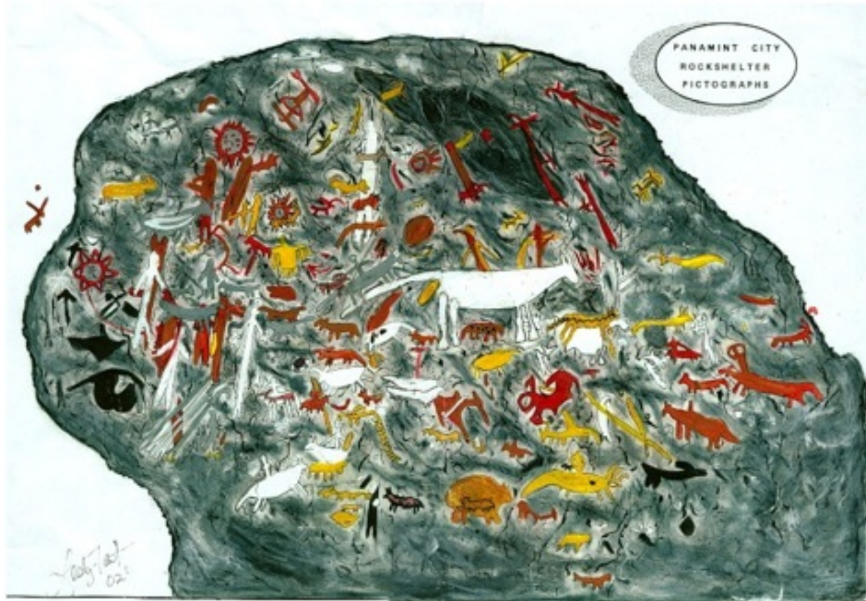
Figure 3 Two zoomorphs on lower right side exhibit atlatl like elements impaling animals. Many sheep are done with Coso Style, front facing horns, Armed bowman are depicted on lower right and upper left areas of panel. Some upside down. Horse and rider images are depicted several times (n=3) in this panel. Illustration rendered by artist based on an original drawing by Suzanne Crowley as it appears in Brooks et al. 1978:11, Figure 1; and Ritter et al 1982:18, Figure 11-1.

by several of our colleagues provided a consistent interpretation that certain images may represent a longhorn steer.