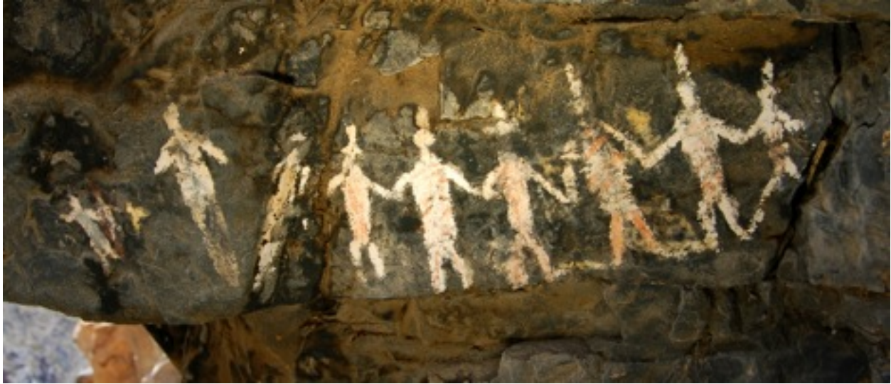
Photo 3. Ten figures, painted in white and embellished in red, are holding hands, six have a feather (eagle?) adorning their heads. This may indicate they are participating in a Round Dance. The figures are also depicted in an arc as if to imply circular movement.