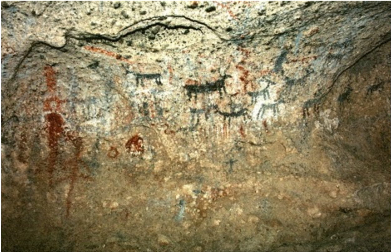
Figure 4. Death Valley. Central zoomorphic figure may be a longhorn steer. Other representations include a number of bighorn sheep and a central human form with a wand or sheep crook. Painting rendered in black, red, and white.

It was not until the 1850s that California began to see the importation of many longhorns to supply the beef requirements of the Northern California gold rush. Supplies of domestic cattle were inadequate to meet the vast demand of the 49er immigrations. With the price of beef escalating, it became profitable for Texas and New Mexico ranchers to drive cattle westwards to feed this large new market (Gordon 1880).