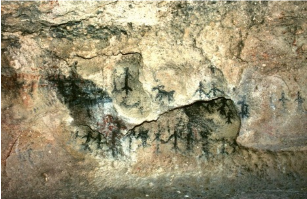
Figure 1. Death Valley. Multiple anthropomorphic figures engaged in a ritual (holding hands or ascending). Single bighorn with bifurcating horns is depicted in Coso Style.

Numic, white pigment, was associated with the sacred realm and has links with spiritual matters (cf. Miller 1983:68). More specifically, the use of white pigment appears to have been especially prevalent in association with rituals and ceremonies relating to the Numic Ghost Dance (cf., Carroll et al. 2002; Stoffle et al. 1995, 2000).