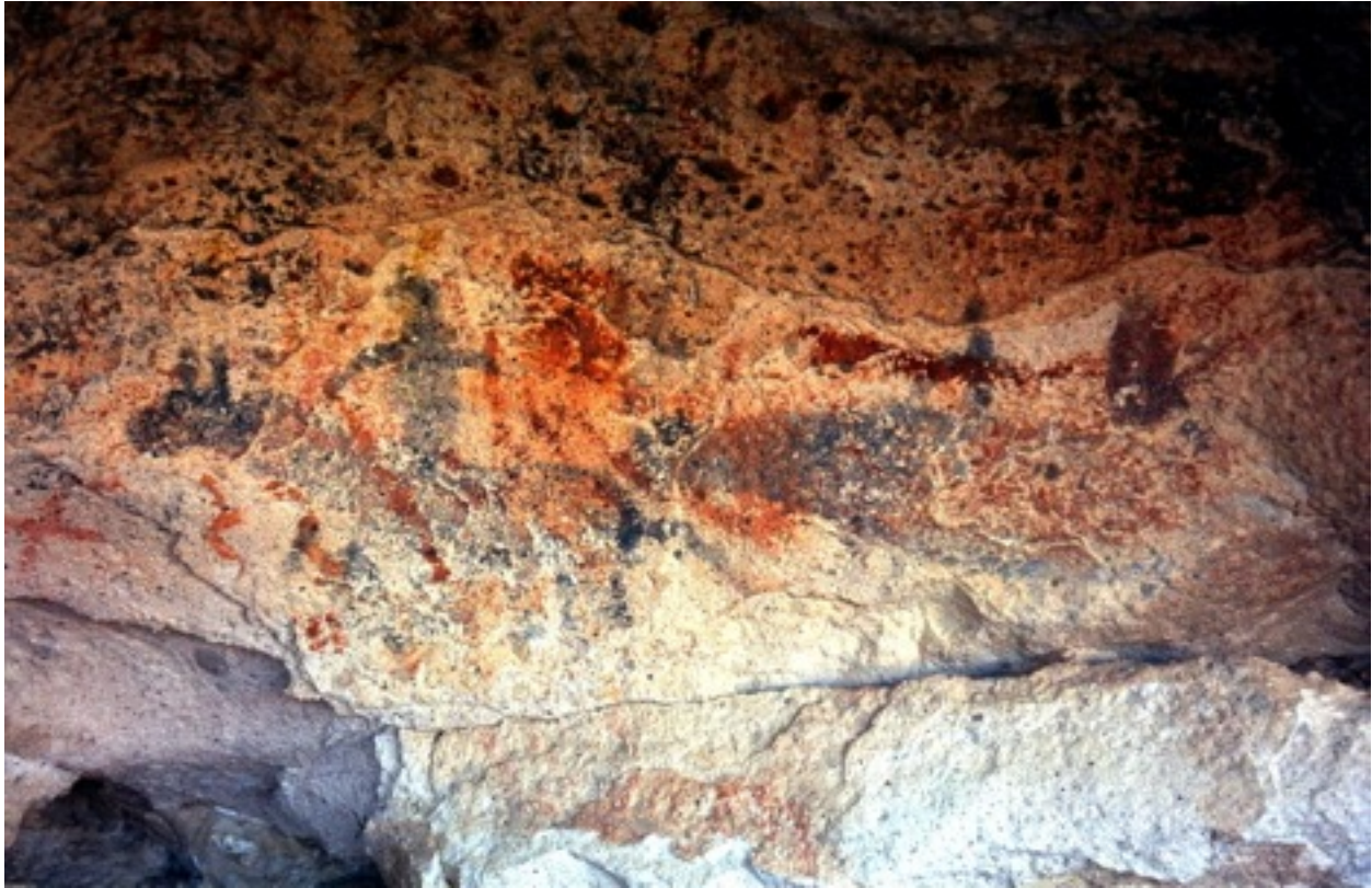
Figure 5. Death Valley. Multiple zoomorphic images perhaps depicting horses with and without saddles.