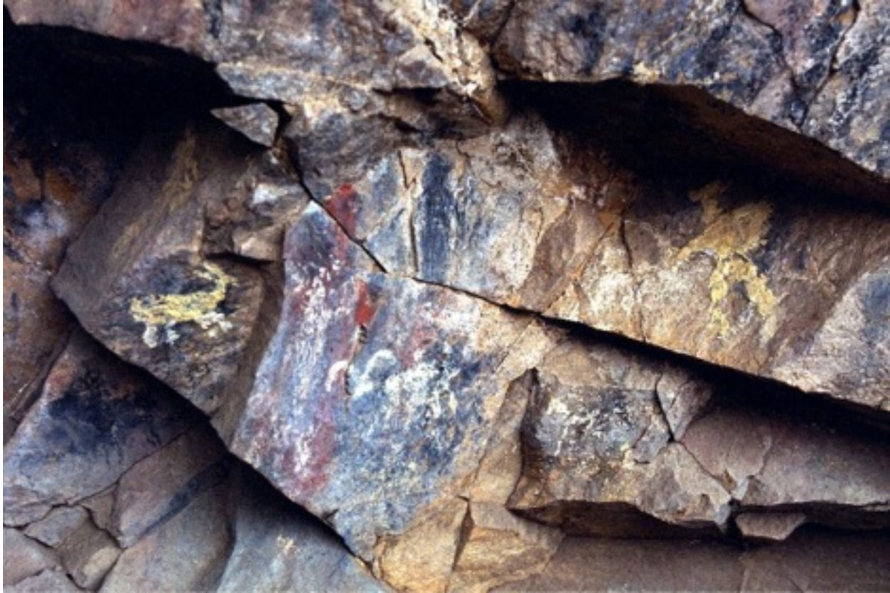
Figure 2. Death Valley. Images Painted in white, black, red and yellow. Coso style bighorn with front-facing bifurcating horns. Another zoomorph rendered on the extreme left.

Schiffman and Andrews (1982:87) point out that most of the horse and rider elements in Coso Paintings are rendered in white (n = 12, 70%). They identify that the prophet of the 1890 Ghost Dance, Wovoka, wore a broad-brimmed white felt hat - a Stetson (Mooney 1973:769) and that Ghost Dance messengers may have been similarly adorned. Wodziwob, the prophet of the 1870 Ghost Dance Movement, was aided by an assistant a Native American rain doctor named Tavibo - meaning "white man" in Northern Paiute. Mooney (1965:4) reports that "two mysterious beings with white skins had appeared among the Paiute far to the west and announced a speedy resurrection of all dead Indians,