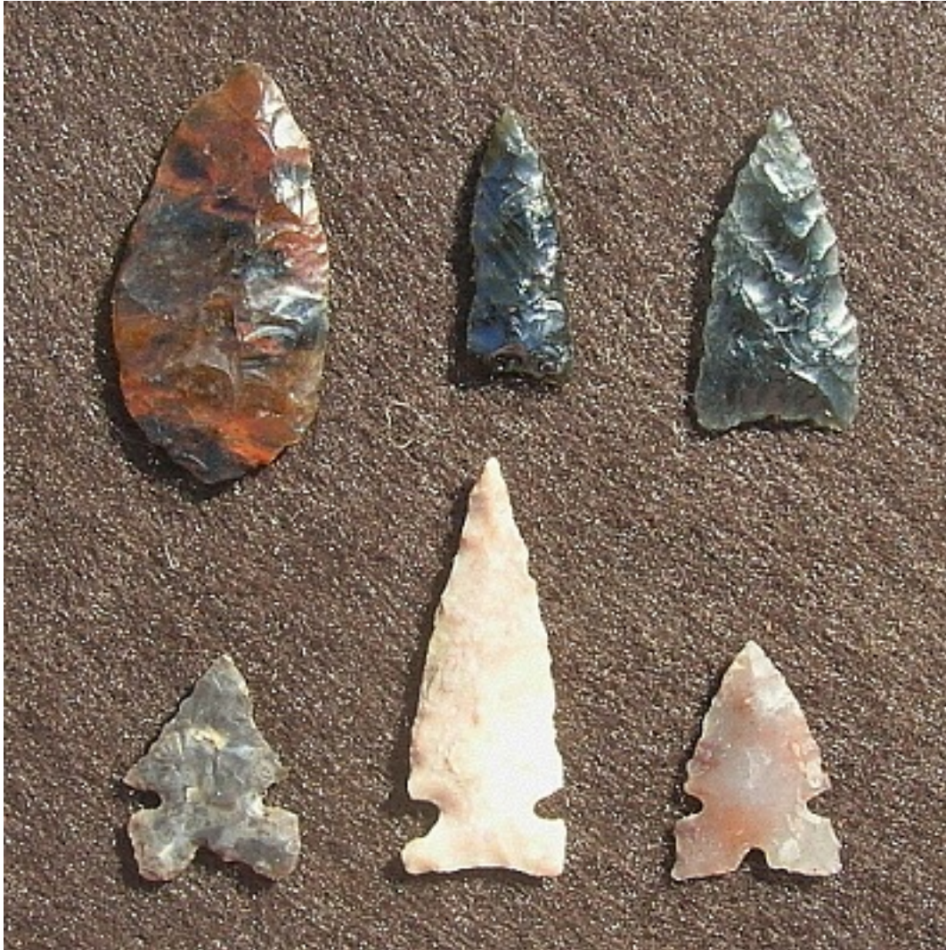
Photo 9. Top row: Cottonwood leaf and triangle points. Bottom row: Desert Side Notch points