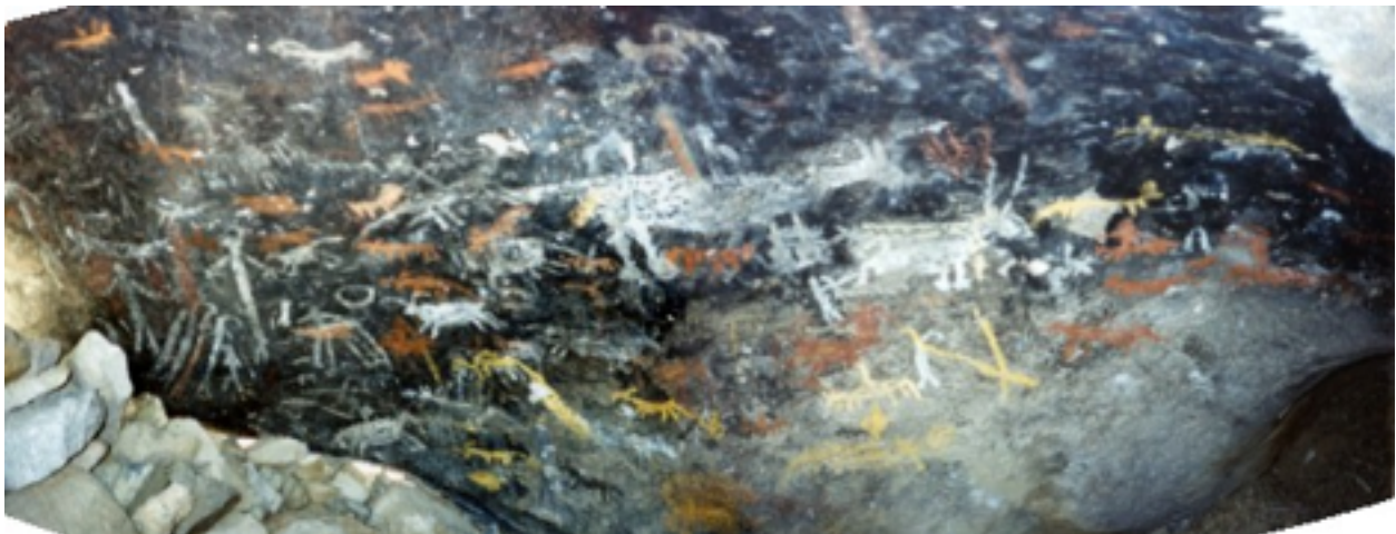
Photo 6. Panorama of the elaborate pictograph found in an eastern California rock shelter.

These painted elements contain the conventionalized images of atlatls with finger grips - rendered in a fashion quite similar to those represented in the Coso petroglyph tradition (Brook et al. 1977:19, Figure 18). Yet this same painting also contains a number of horse and riders and individuals wearing Western-style, wide-brimmed (Stetson) hats (Brook et al 1977; Ritter et al. 1982). A revitalization and re-emphasis on traditional imagery would be inferred since atlatls were not a part of the Native cultural repertoire at this historic date. Therefore, evidence seems to point to a historic attempt at copying the earlier iconography found in the nearby Coso Range petroglyphs (emphasis added; cf. Sutton 1981)1.